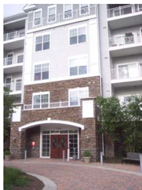
Cattail Cove Townhouse in Cambridge Maryland

Once again we have been able to place students in all nine counties of the Eastern Shore.