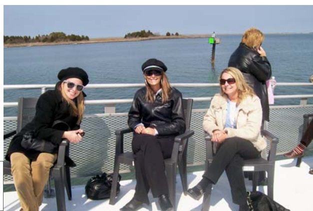
Not all work as students enjoy a ride to Smith Island

Research (GGEAR) program at University of Maryland Baltimore for consistently funding GAIT for over 10 years. Additional THANKS to the Johns Hopkins Geriatric Education Center Consortium for its recent 3 years of funding.